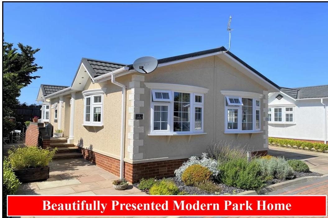
Beautifully Presented Modern Park Home

1 Knoll View, Winfrith Newburgh, Dorset. DT2 8GL